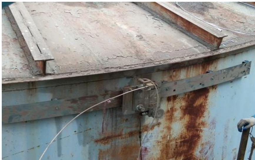
Straight track on the tank wall with magnets

When in need of vertical cutting, we will use double strap to fix the track on the wall.